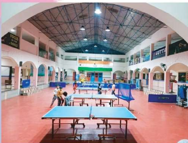
Table Tennis Academy

Professional coaching for Table Tennis is now a new feature of Modern School. As a part of regular class time table, the students from class one onwards shall get age appropriate coaching in Table Tennis in school campus only. However, for the professional growth, the classes shall be held in evening too.