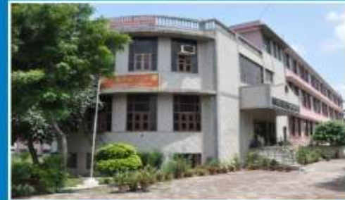
School Building at Vaishali, Ghaziabad