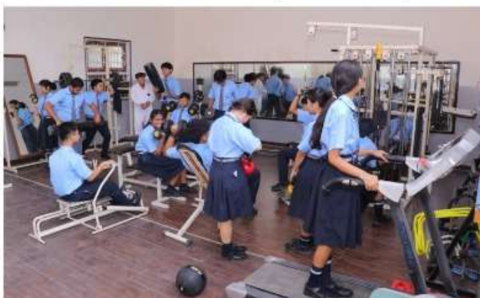
Gym & Aerobic Centre