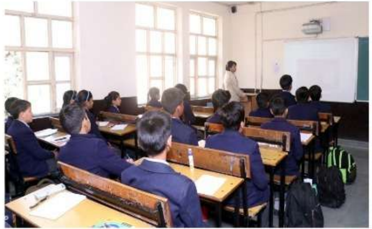
Learning through Smart Class

Digital learning modules support conceptual clarity and help in experiential learning with new age interactive simulations-Mathematics and Science labs-a few tools to name.