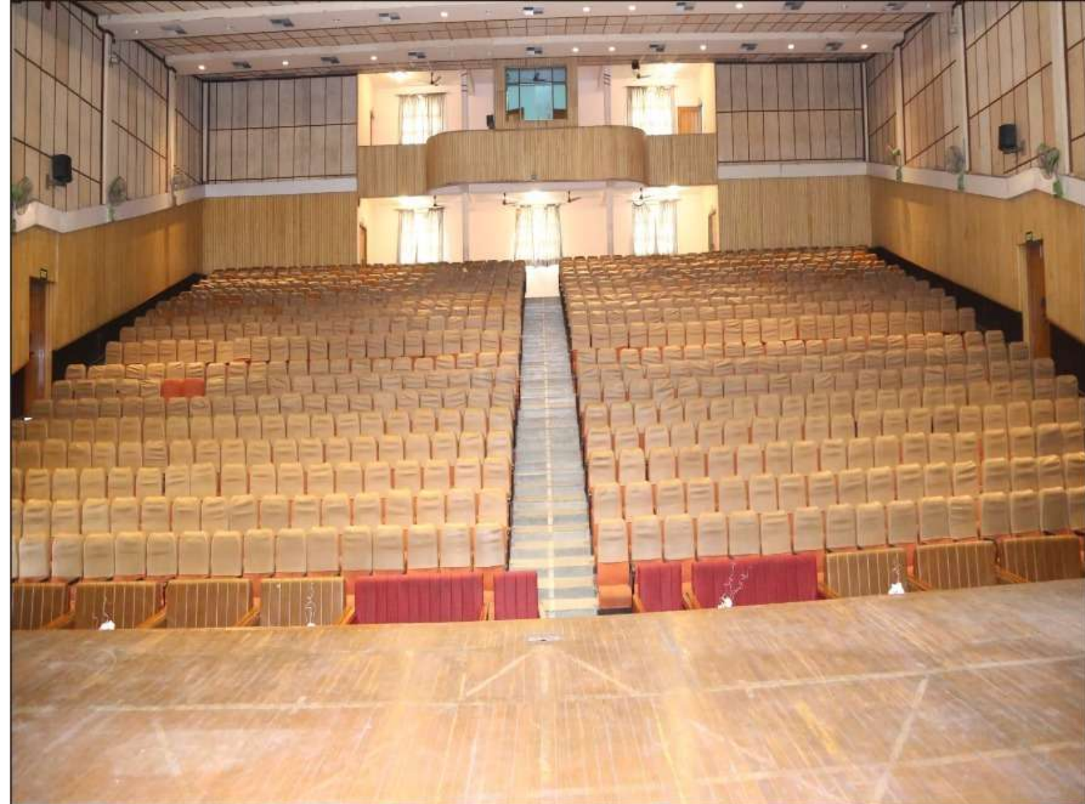
Air Conditioned Bhagwan Mahavir Auditorium with 1200 seating capacity