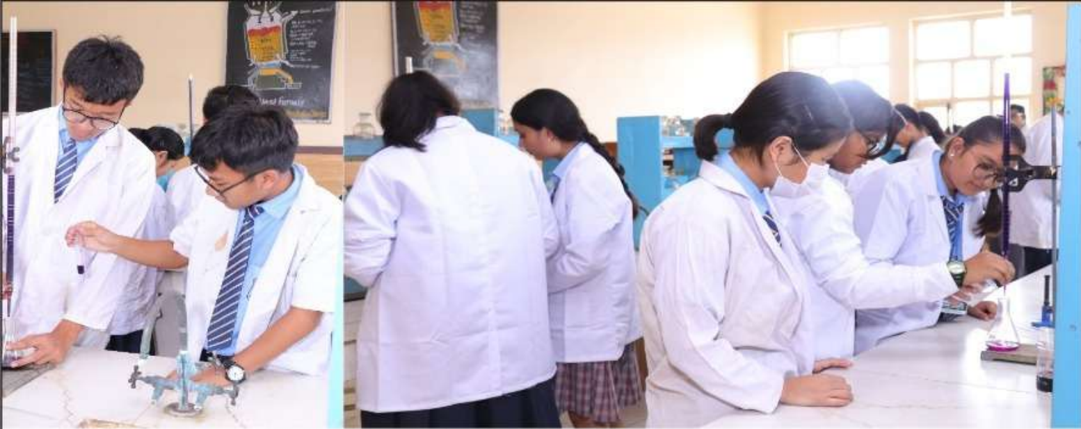
Chemistry Lab in action