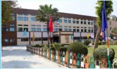
School Building at Faridabad