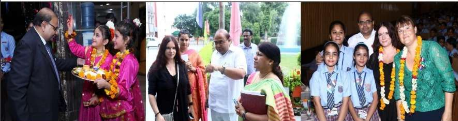
Sharing views with French Delegates

“I cannot change the direction of the wind but I can adjust my sails to always reach destination.”