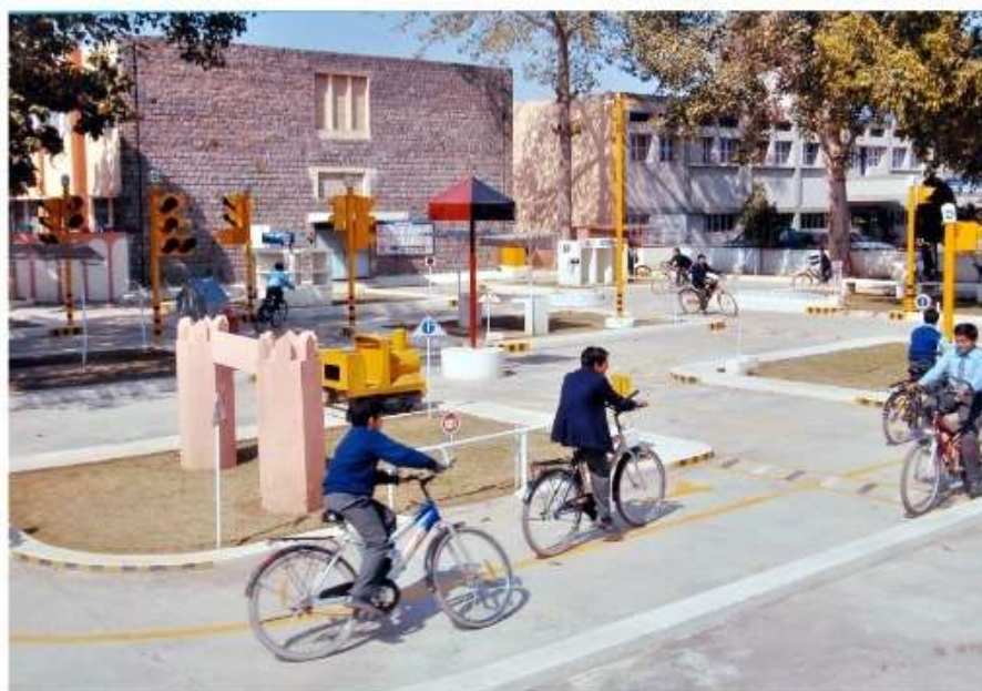
Learning Safety Rules

Since bookish-knowledge is not sufficient, the school provides a road sense traffic park-first of its kind in the State of Haryana, where students learn the traffic rules in an innovative way.