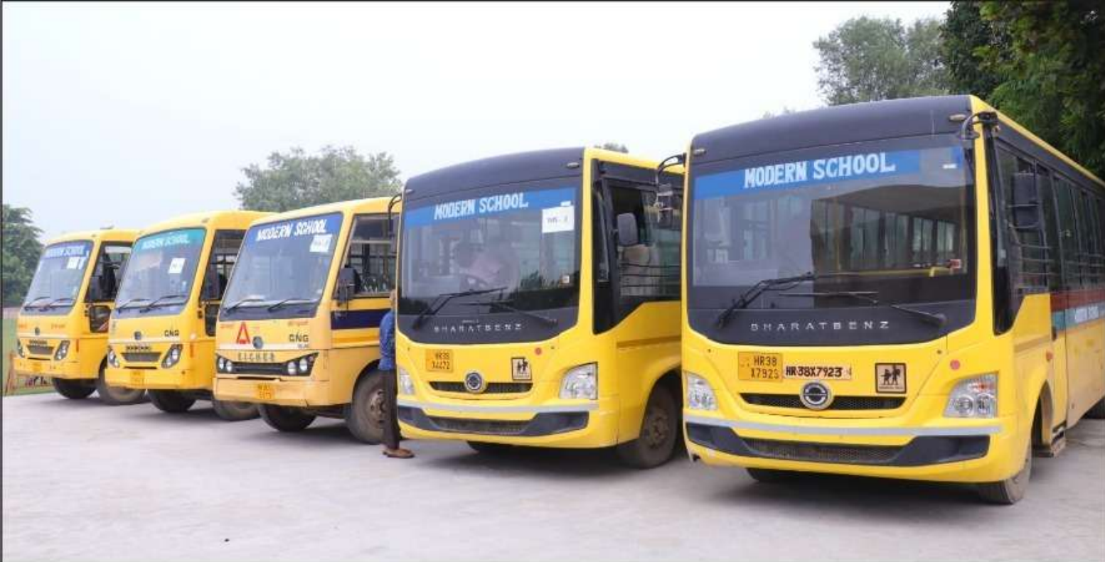
Fleet of School Buses