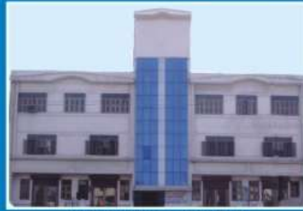
DIHS Building at New Delhi