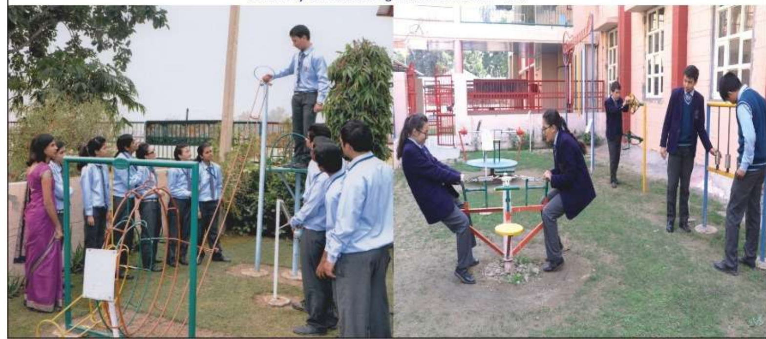
Practically demonstrating in Science & Solar Park

A unique Science and Solar park has been developed to give a spark to the young ignited minds. Different working models have been displayed on the science formulae-Centrifugal force of gravitation and solar energy etc. to make the learning a fun. This park is the first of its kind in Faridabad District.