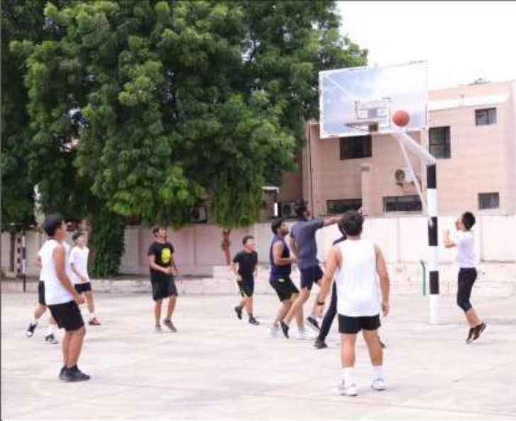
Let's play Basketball !