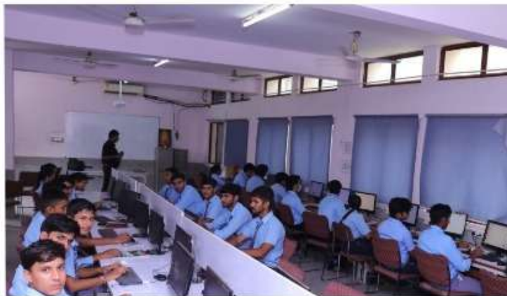
Computer Science Lab