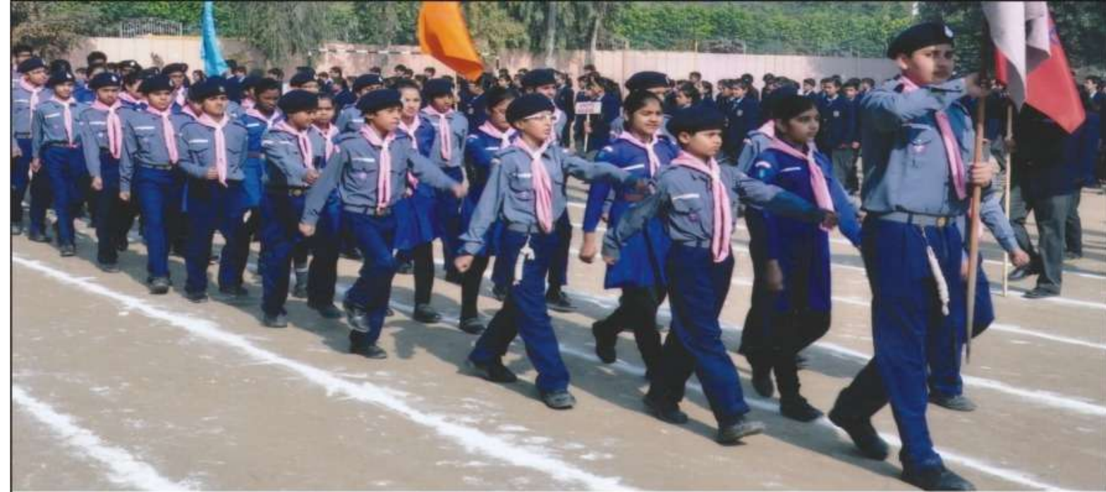
Leaders of Tomorrow Marching ahead