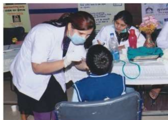
Doctors on Routine Check-up