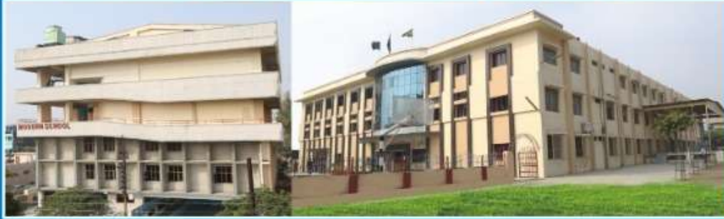
School Building at Sector-11, Noida