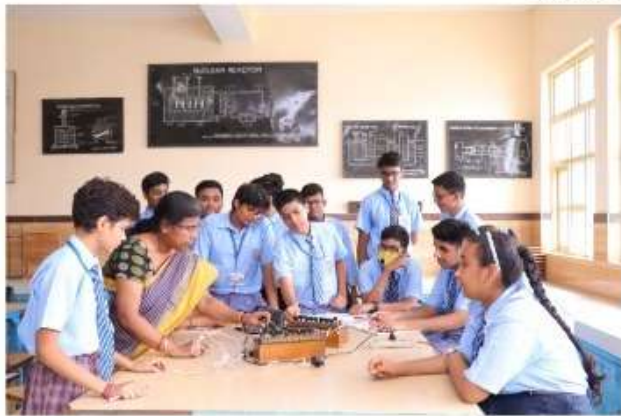
Physics Lab in action