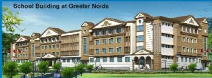
School Building at Greater Noida