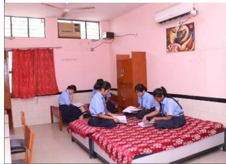
Inside view of Room