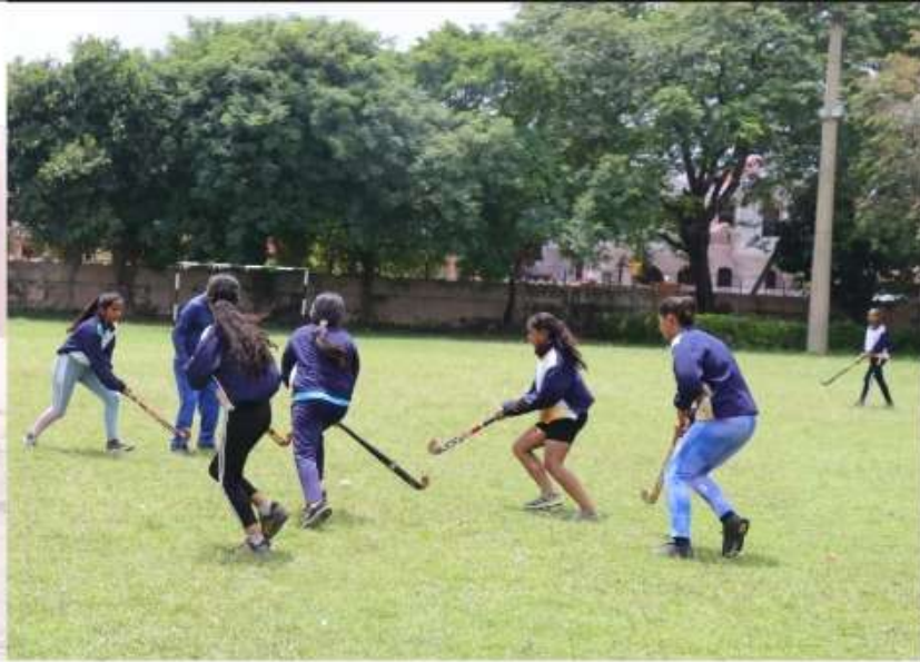
Let's play Hockey !