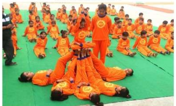
Yoga for all