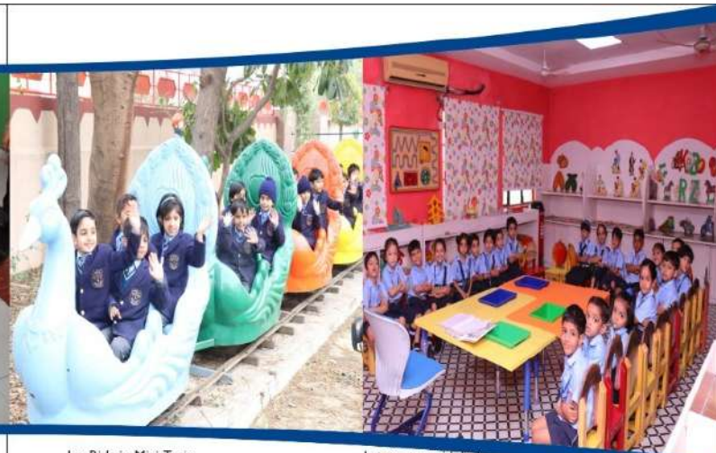
Joy Ride in Mini Train