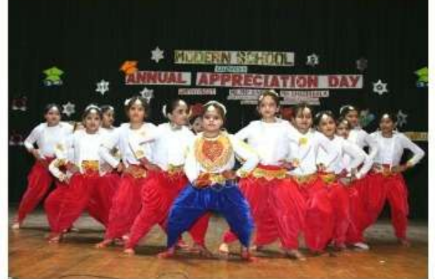
Dancing damsels in high Spirits