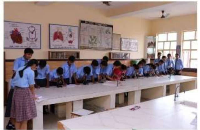
Biology Lab in action