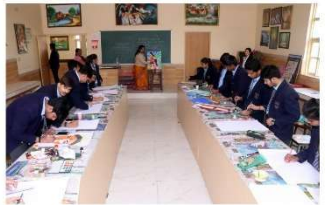
Fine Arts Lab