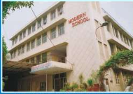
Modern School at Sector-12, Noida