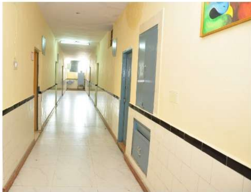
Hostel's Inside View