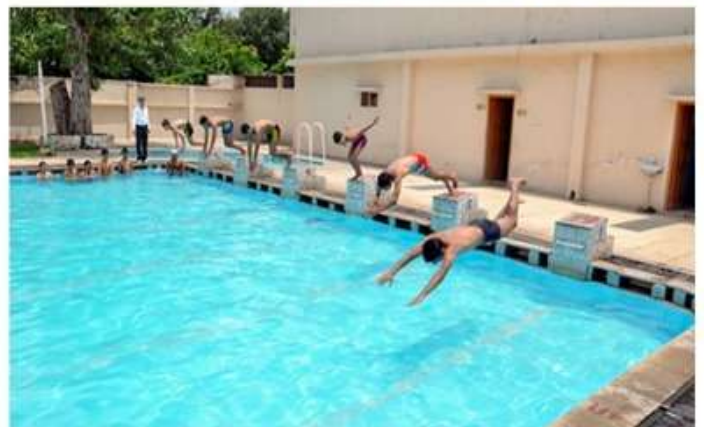
Swimming in action

To keep the students physically fit, the school has developed a unique Gym & Aerobic Centre with facility of steam bath under the care of qualified naturopath.