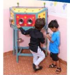
Based on theme of Flora-fauna, technology & universe

Tiny Tots amuse themselves and feel exhilarated while having a joy ride in the MINI TRAIN and JET BOAT in the Children Park designed and equipped for these young ones. Traffic Training Park, Toddler Pool, Swings, Musical Rides, water falls & Mountains are some of the star attractions of our Dream Land.